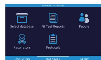
Data Base Setting